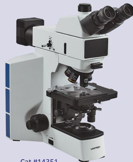
Cat #14351 Reflected & Transmitted