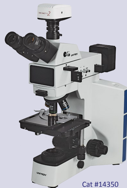
Cat #14350 Reflected (Shown with camera)